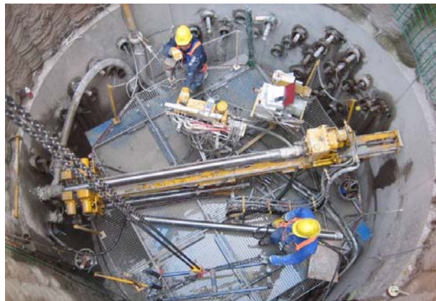
A typical grout shaft

Grout shafts are used to mitigate the effects of settlement (slight movements of the ground) that can be caused by tunnelling or other excavation works. Compensation grouting is a well established technique that works by injecting cement-like material into the ground via small diameter underground pipes which fan out from a main shaft. Injected under pressure, the grout firms up the ground and compensates for any settlement caused by the tunnelling works. The shafts are 4.5m in diameter, 18m deep and will be located in the carriageway around Soho Square.